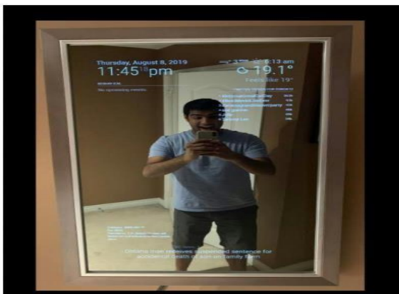
Fig 7. Face Recognition and the smart mirror

The Mirror displaying the required information, working as "Smart" as well as "conventional" mirror too.