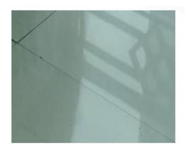
Fig.2. A Two-Way Mirror

The Smart Mirror, where a two-way mirror, LED monitor, Raspberry Pi 3B+ is used. Raspberry-Pi 3B+ has built in Wi-Fi access such that the information which is displayed on the monitor is accessed via Wi-Fi. A two- way mirror with wooden frame is attached to the LED monitor, such that the information displayed on the mirror is appeared on the mirror.