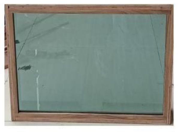
Fig.3 Wooden case attached to the Twoway Mirror