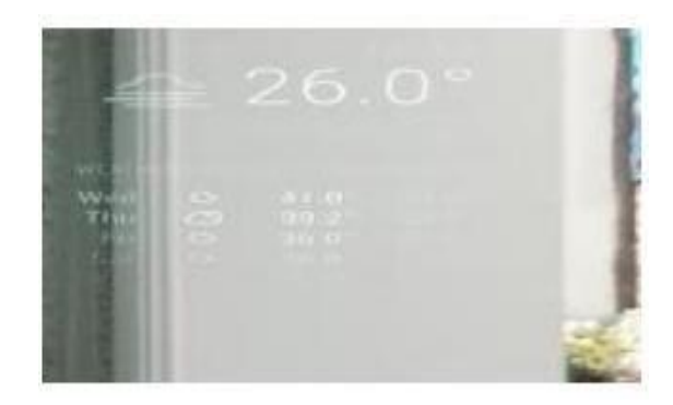
Fig 4. Current Weather and Weather forecasting is displayed on the mirror.