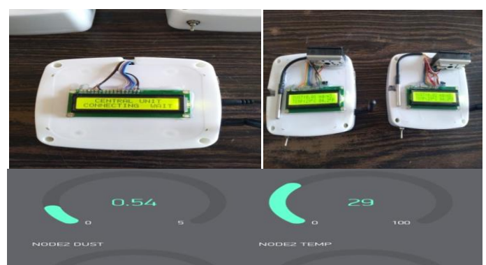
Figure : Shows the configuration of Blynk app, which is taken from smart phones, the blynk app works through the connection of the wifi, hence it signifies that the real time values can be viewed continuously through smart phones whenever at any point

Blynk is designed for the Internet of Things. It can control hardware remotely, it can display sensor data, it can store data, visualize it and do many other cool things. There are three major components in the platform: