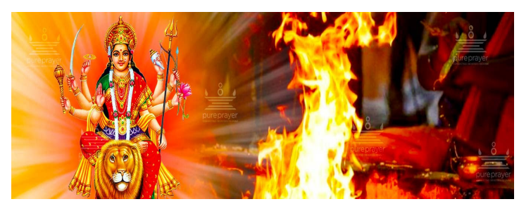
Fig 1: ChandiHoma WebBanner

"The sacred Durga Saptashati[1] Path is said to be a significant component to conduct the chandi homam to attain good health and overcome enemies. Durga saptashati path is performed along with chandi homam. A total of 700 verses of texts offer devotion to Goddess Durga through sacred fire during Chandi Homam or Chandika[2] Homa or Chandi Path.