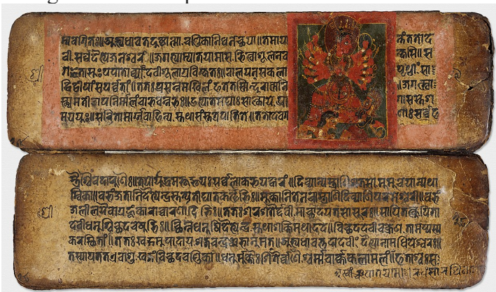
Fig 3: Devi mahatmya (Glory of the Goddess)

Devi Mahatmyam is also known as the Durgā Saptashatī or Śata Chandī text contains 700 verses arranged into 13 chapters.